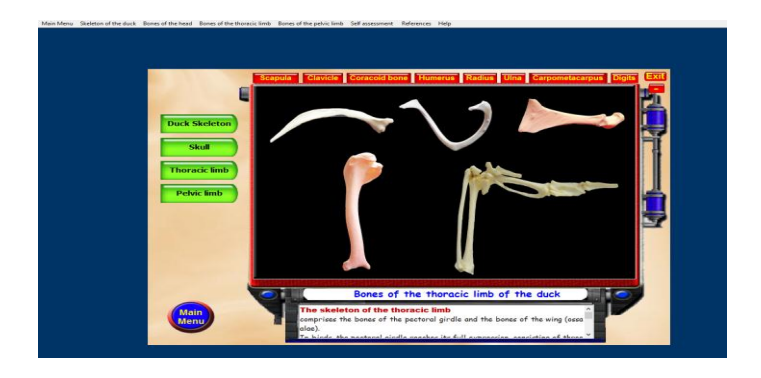
Fig. 4: A printed screen of the program showing the bones of the thoracic limb with eight buttons above the 3D specimen labeled: Scapula, Clavicle, Coracoid bone, Humerus, Radius, Ulna, carpometacarpus and digits.

Computer-generated models of the bones are not new, but only very recently has become possible to create bone model that provides realistic, interactive anatomic information with true visualization. This new teaching tool has far-reaching implications not only for students