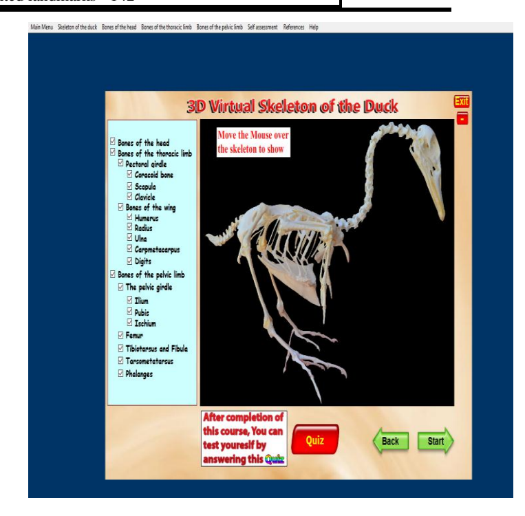
Fig. 2: A printed screen of the main menu of the program with the three buttons: Start, Back, and Quiz. On the left side of the screen, there is a list of the prepared bones from duck skeleton, and on the centre of the screen, there is 2D image when rollover the mouse on any part, it will be highlighted with different color and information will displayed beside it.

proper access to the entire program, use the dropdown menus from the menu bar on the top of the screen and navigate the main menu of the program.