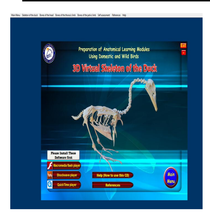
Fig. 1: A printed screen of the introduction page showing the title of the program, the user can access help (How to use this CD), show references used during the preparation of the program, install required software for

proper access to the entire program, use the dropdown menus from the menu bar on the top of the screen and navigate the main menu of the program.