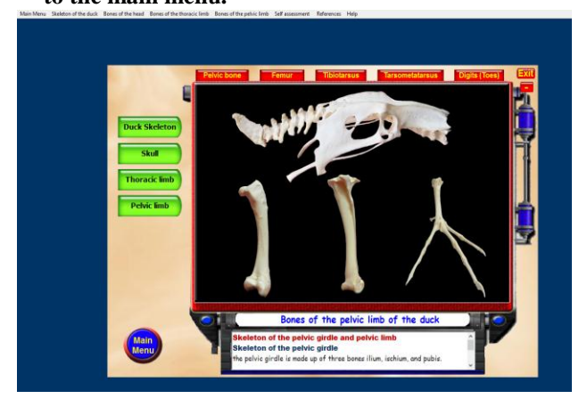
Fig. 5: A printed screen of the program showing the bones of the pelvic limb with the five buttons above the 3D specimen labeled: Pelvic bone, Femur, Tibiotarsus, Tarsometatarsus, and Digits (Toes).