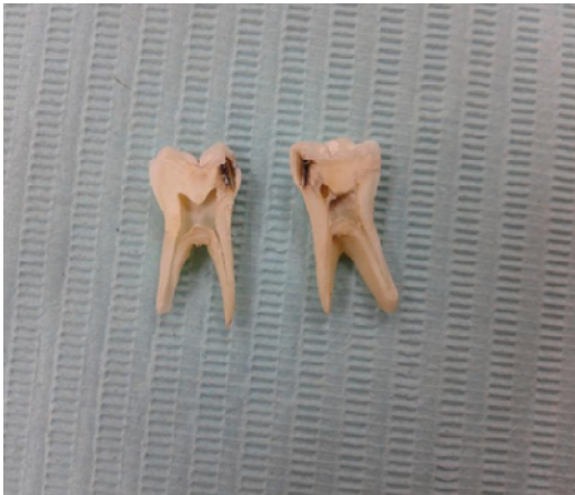
Figure (1): The teeth were longitudinally cut through the centre of carious lesion, mesio-distally, in two sections before caries removal.

It has been found that Papacarie produced significant reduction on the mean micro-tensile bond strength ( \mu TBS) for both the glass ionomer and resin composite with an insignificant difference ( 22.9 \pm 9.01 \mu TBS and 25.97 \pm 6.14 respectively). On the other hand; there is a significant difference between GI and composite resin for the mechanical preparation method with the higher mean produced for the composite resin ( 38.63 \pm 8.48 \mu TBS and 74.08 \pm 12.88 respectively).