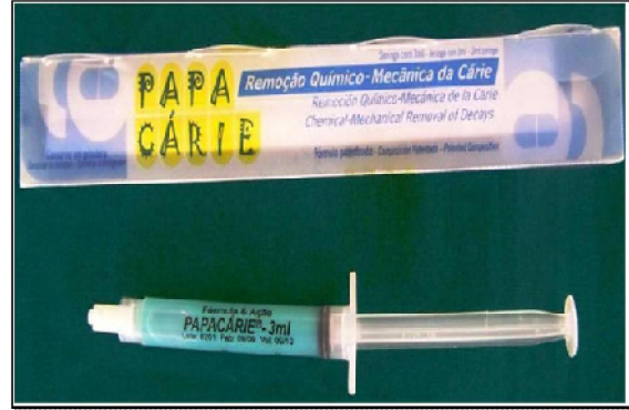
Figure (2): Papacarie (F&A Laboratório Farmacéutico Ltda, São Paulo, Brazil).